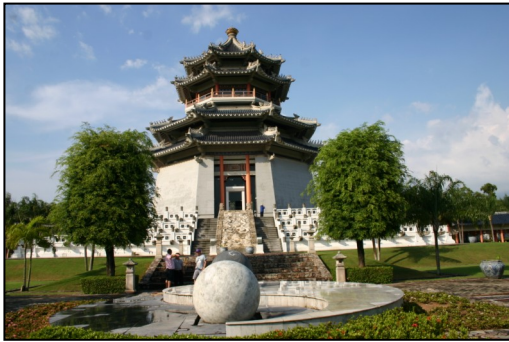
Part of the stunning Three Nations Gardens at Horseshoe Point.