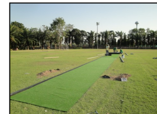
The square is laid at Horseshoe Point at the end of 2009

Events are subject to change by the organising committee